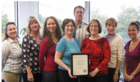
IHMM staff (left to right)